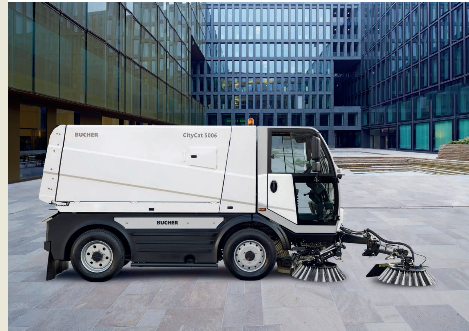
Performance package in the compact class